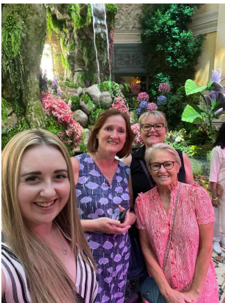
At the magnificent Bellagio hotel and casino